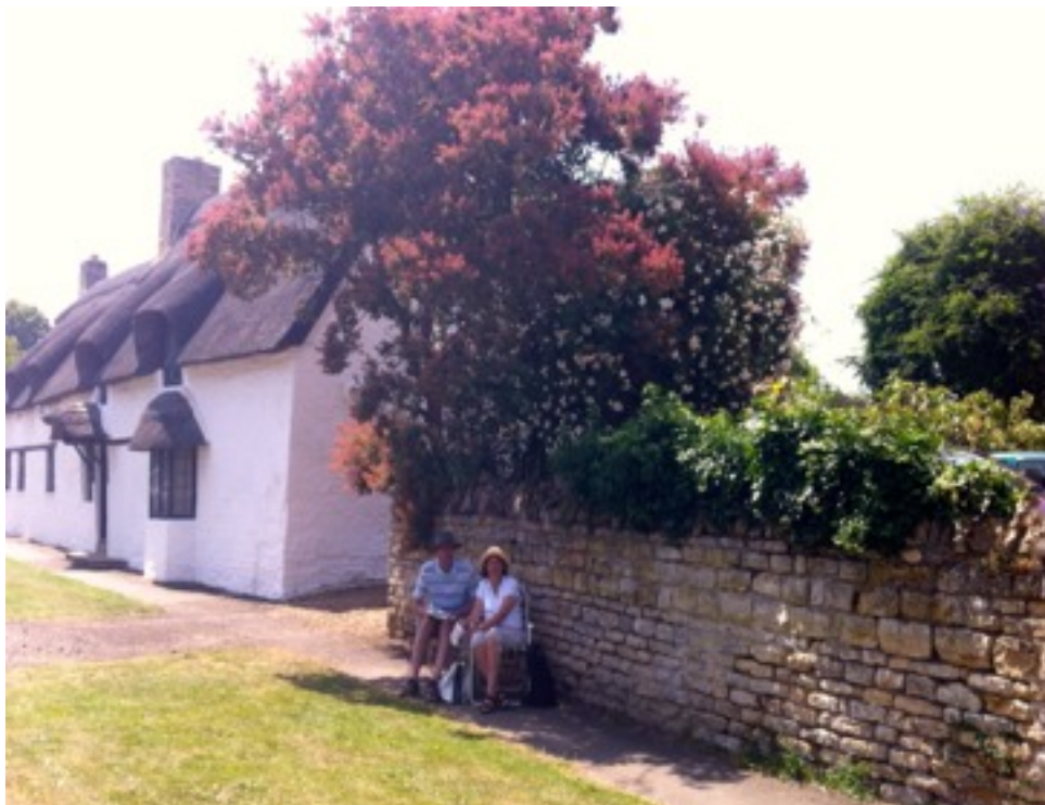
John Clare's cottage. This year visitors to the Festival needed to shelter from the sun.