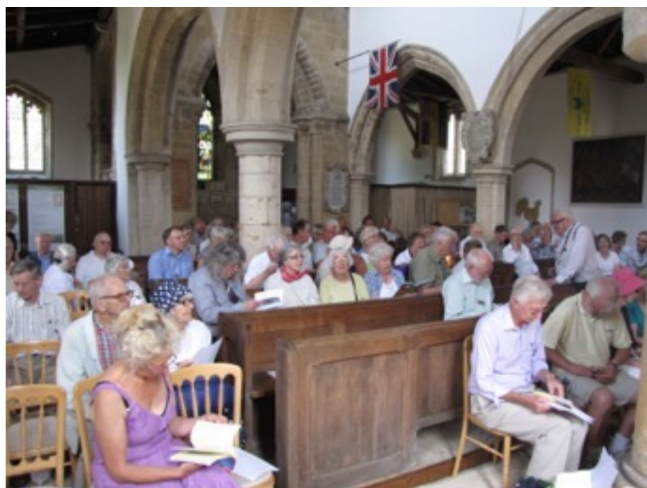
In Helpston Parish Church.